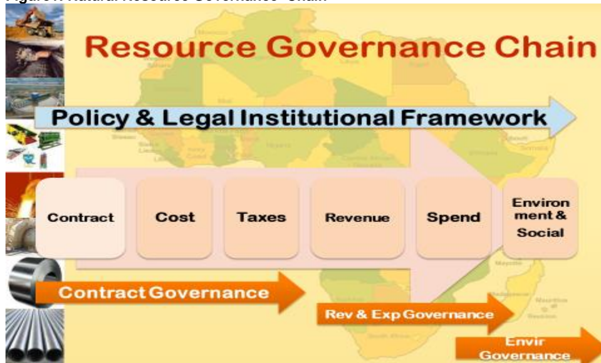
Figure1: Natural Resource Governance Chain

Secondly, citizen engagement in natural resource governance is minimal because of the unavailability of information that would be the basis for effective engagement and the pervasiveness of misinformation. Furthermore, there is the lack of clarity of how citizens can take action to improve the situation – both mining affected communities as well as civic actors.